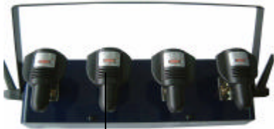
Warning logo & laser aperture label