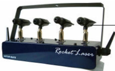
4 Laser Apertures