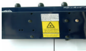
Certification, identification and warning label